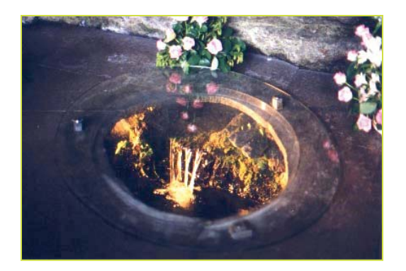
PHOTO above: the Lourdes spring as it comes out of the Massabielle. This is how pilgrims to the Shrine today can view it.