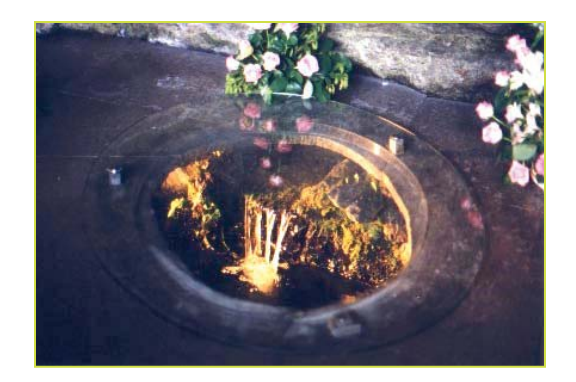
PHOTO above: the Lourdes spring as it comes out of the Massabielle. This is how pilgrims to the Shrine today can view it.