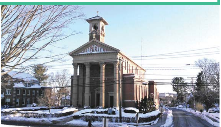
FRONT COVER: Mary Immaculate of Lourdes Church, February 8th, A.D. 2021.

The matter at hand is this. The Pharisees held that every Jewish male over 20 had to pay 2 drachmas a year for the support of the Temple in Jerusalem. There is an element of coercion here, hence Peter replies "yes" in a reflexive defense. Christ lays out a short parable for Peter to understand the truth of the matter. (Remember this is after Peter has made his Confession on Jesus' real identity: Thou art the Christ, the Son of the living God (Matthew 16:16).) Therefore Jesus as the Son of God is not bound to give tribute to the Temple. Nonetheless, in order not to give cause for scandal, Jesus conforms to the pharisaical custom. In a wonderful way the Lord tells Peter the fisherman how to procure a stater , the Greek coin worth 4 drachmas, in order to pay