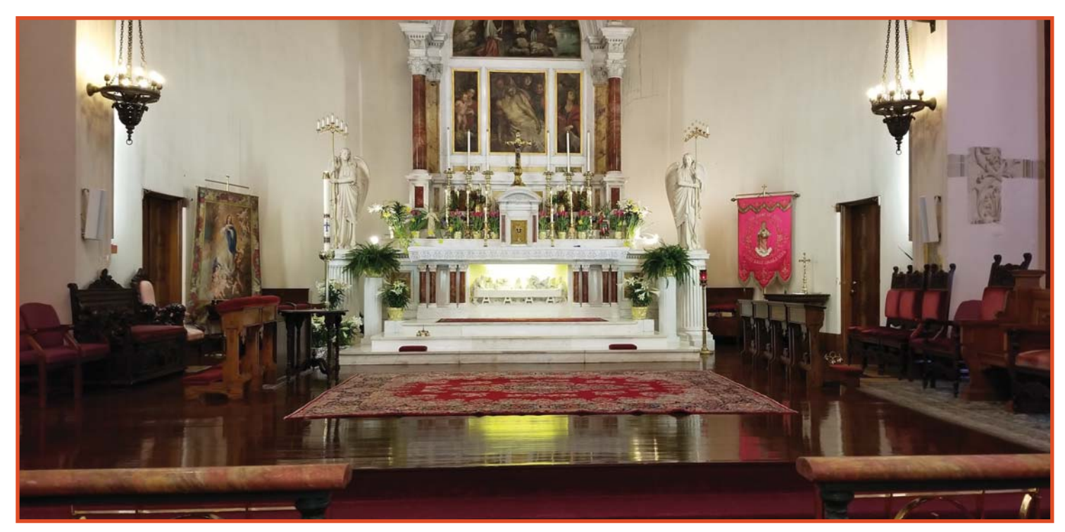
FRONT COVER: The sanctuary of Mary Immaculate of Lourdes, Easter Week, 2021 A.D.