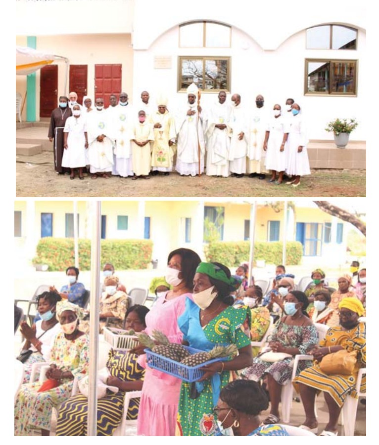
May 9th, A.D. 2021