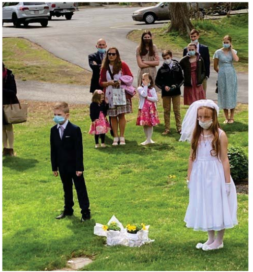
PHOTO ALBUM OF FIRST HOLY COMMUNIONS and MAY CROWNINGS