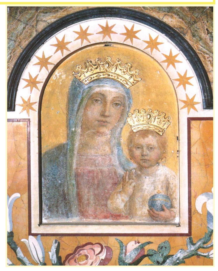
MADONNA del SOCCORSO (Our Lady of Help)