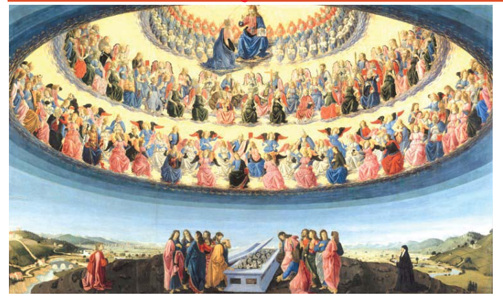
FRONT COVER: "The Assumption of the Virgin", Francesco Botticini, 15th Century.