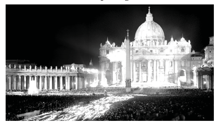
PHOTO above: On the night of the opening of Vatican II on October 11th, 1962 the young people of Catholic Action held a torchlight parade in St. Peter's Square. As they formed the shape of a Cross with their torches Pope John XXIII unexpectedly opened his window and made an informal address to the crowds below.

connection between Mary's intercessory role and the anticipated work of the Council. We see this manifested also in Pope John's pilgrimage to the Holy House of Loreto just before the Council's opening.