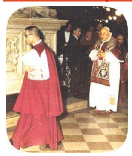
PHOTO left: Pope St. John XXIII visits the Holy House of Loreto shrine on October 4th, 1962 to pray for the success of the Second Vatican Council. Pope Benedict XVI repeated this pilgrimage in 2012 to mark the 50th Anniversary of the Council's opening.