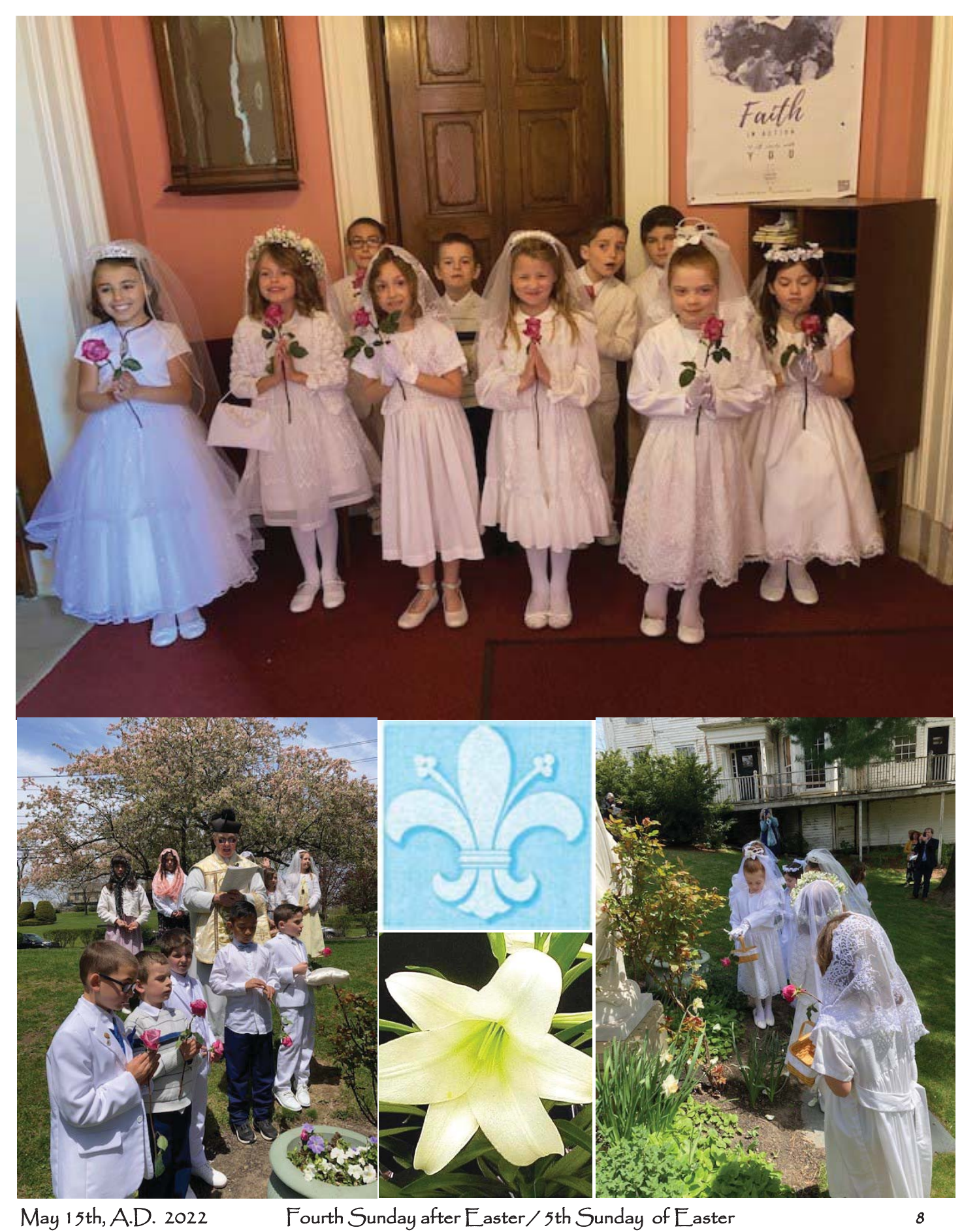
Fourth Sunday after Easter / 5th Sunday of Easter Mary Immaculate of Lourdes, Newton/Needham, Massachusetts