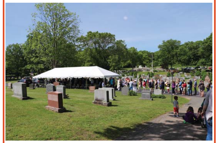
Refreshments will be served after Mass.