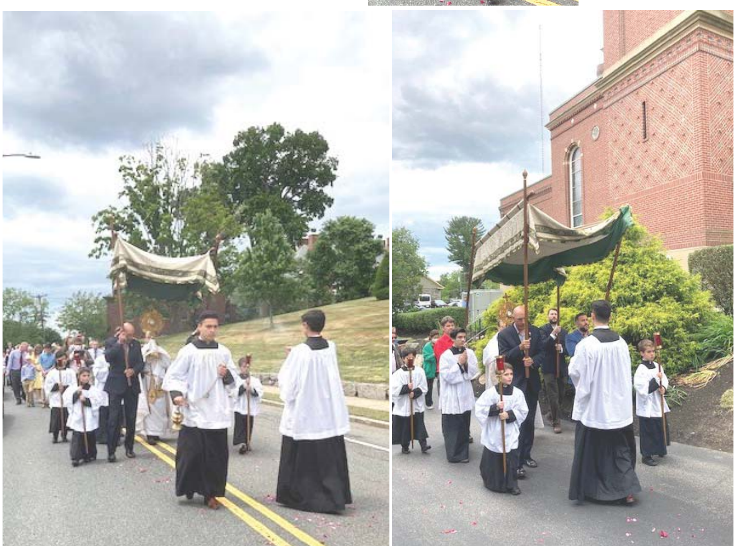
June 26th, A.D. 2022

Full and clear ring out thy chanting, Joy nor sweetest grace be wanting, From thy hearts let praises burst.