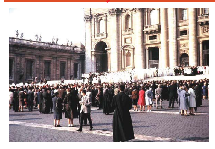
(PHOTO above: The Grand Procession which opened the Second Vatican Council on October 11th, 1962. PHOTO below: The torch-light procession of Catholic Action that same night.)