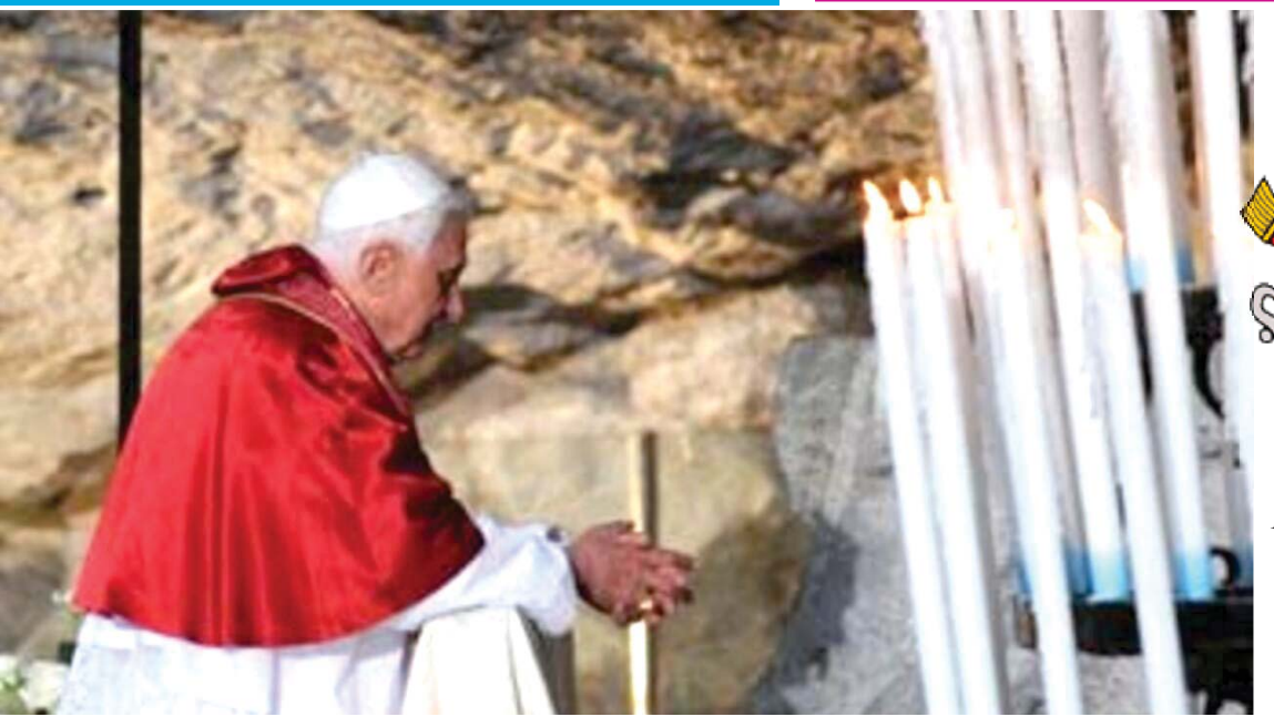
Pope Benedict XVI praying in the Grotto at Lourdes, France. (150th Jubilee of Lourdes)

"I REJOICE TO BE LITTLE, BECAUSE ONLY CHILDREN AND THOSE WHO ARE LIKE THEM WILL BE ADMITTED TO THE HEAVENLY BANQUET"—ST. THERESE OF LISIEUX (+1897)