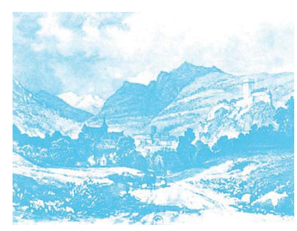
FRONT COVER, SKETCH & PHOTO: Sketch of the town of Lourdes at it was in 1858: Photograph of the Massabielle at it was in 1858 during the Apparitions