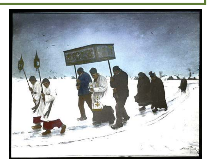
Procession of bringing Viaticum, the Communion for the dying, in French Canada (1800s).

HIM THIS IN A THOUSAND LITTLE WAYS."—ST. THERESE OF LISIEUX (+1897)