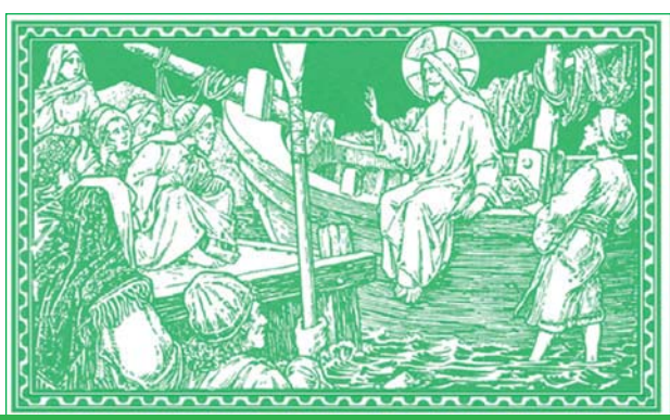
I will utter things hidden from the foundation of the world.