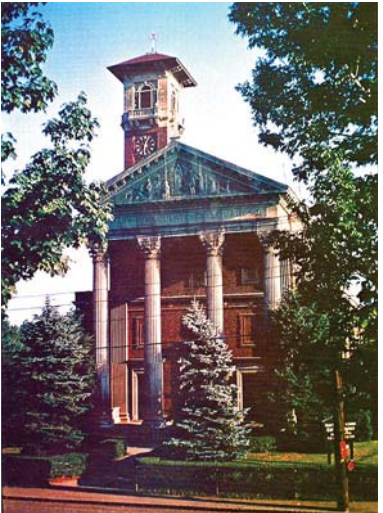
FRONT COVER: Our Parish Church of Mary Immaculate of Lourdes as it appeared in 1970, the Centenary of the Parish's founding (1870), as St. Mary's, and the 60th year of the present church.

Thanksgiving Day is always a doublefeast for our parish of Mary Immaculate of Lourdes. In addition to our national holiday of Thanksgiving it is the Dedication Feast for our parish church, which was consecrated on Thanksgiving Day, 1910, 113 years ago.