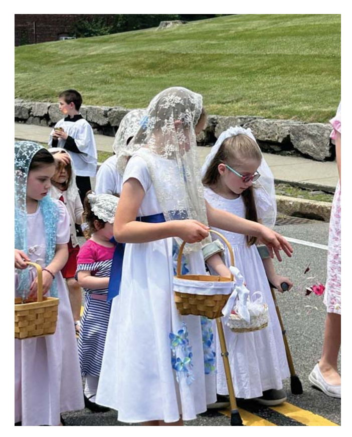
PHOTO: Flowers girls strew rose-petals during the Parish Corpus Christi Procession, June 2nd, 2024.

Ask yourself this question: What if I drastically cut back on my screen-time and dedicated myself instead to the prayerful memorization of passages from Scripture, especially from the Psalms? I guarantee you, your spiritual health would improve.