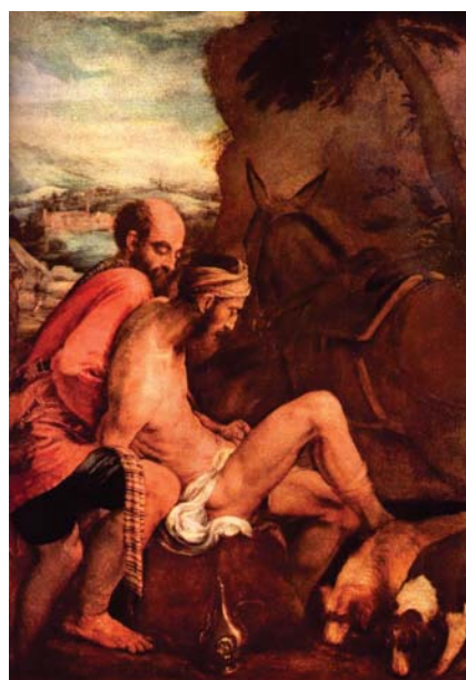
The Good Samaritan (ABOVE); St. Raymond Nonnatus, Confessor (BELOW)